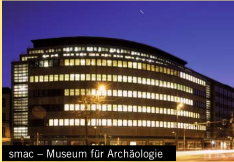
smac – Museum für Archäologie