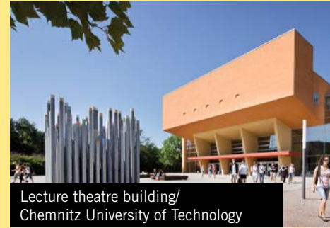
Lecture theatre building/ Chemnitz University of Technology