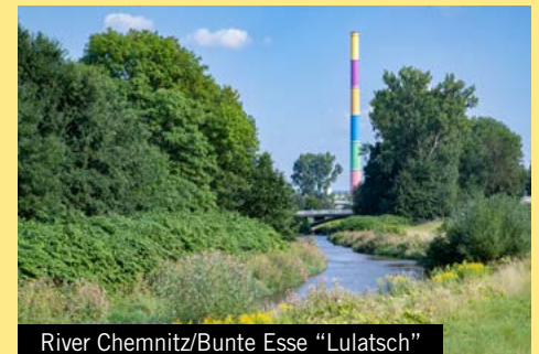
River Chemnitz/Bunte Esse "Lulatsch"