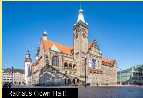
Rathaus (Town Hall)