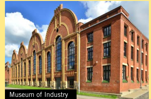
Museum of Industry