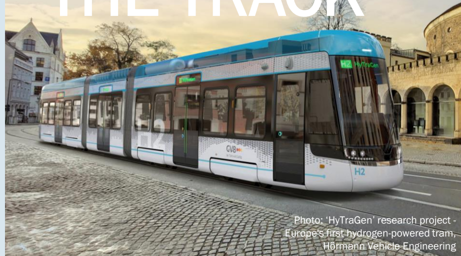
Photo: 'HyTraGen' research project - Europe's first hydrogen-powered tram, Hörmann Vehicle Engineering

A history of mobility: Chemnitz was the cradle of locomotive construction with engineer and entrepreneur Richard Hartmann. Germany's first automotive group, Auto Union, started its production in Chemnitz.